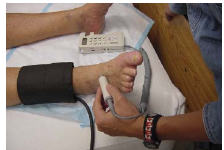
Performing a Doppler assessment of a pedal pulse