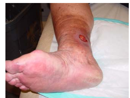
Venous ulcer with evidence of hemosiderin staining .