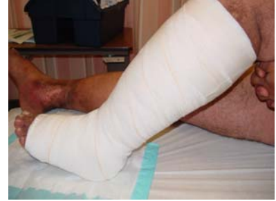
An example of the 1st 3 layers of high compression bandage

Be careful when applying this layer that you do not pull what has been previously applied, tighter. Hold the area already wrapped as you stretch the bandage.