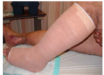
Finished high compression bandage