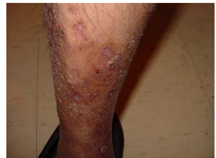
Hemosiderin staining in early stages of venous disease.