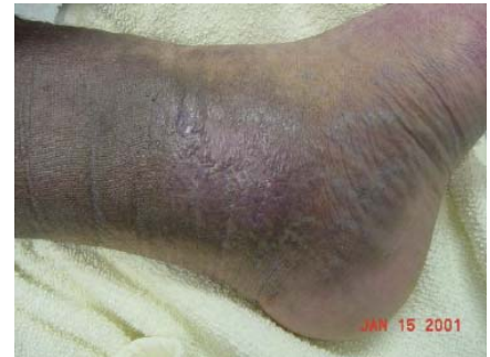
Lipodermatosclerosis , also known as “woody fibrosis” because of the texture of the skin.

Red blood cells (RBC) that move into the interstitial spaces die after 3 months. The products of the degradation of the RBCs include the iron from the hemoglobin. When this iron becomes trapped in the tissues in increased amounts, the client will experience a brown staining on the lower leg, called hemosiderin staining .