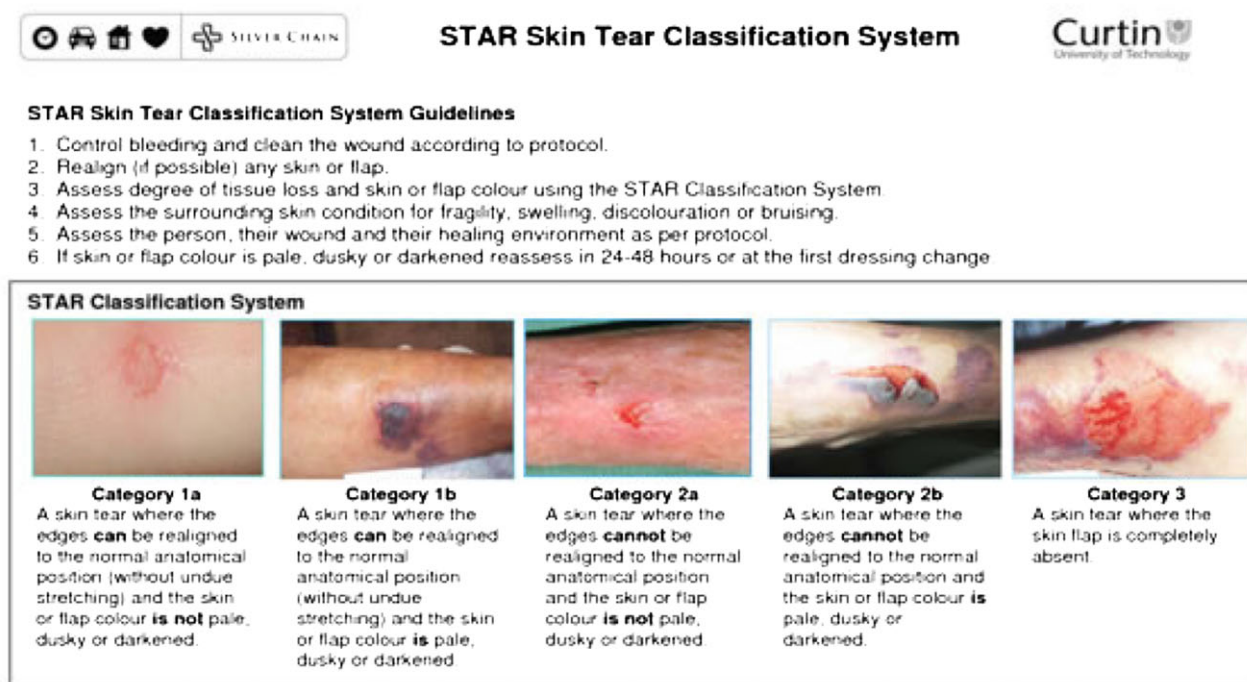
Table 1 STAR skin tear classification system (34)

Skin Tear Audit Research (STAR) – Silver Chain Nursing Association and School of Nursing and Midwifery, Curtin University of Technology. Revised 4/2/2013