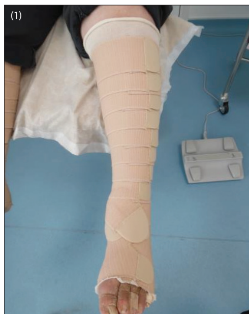
Figures 1 and 2. Easywrap in situ.

a patient goes from supine to standing (Nazarako, 2017). This leads to venous insufficiency and due to increased capillary filtration into the tissues, will often predispose the patient to oedema formation (Elwell, 2015). This is due to the impact that venous insufficiency has on the capacity of the lymphatics which, as well as functioning as part of the immune system, has a primary role in the transportation of 100% of interstitial fluid back into the circulatory system (Woodcock and Woodcock, 2012). The lymphatic system becomes overwhelmed and unable to effectively transport the fluid which, if left untreated and present for more than 3 months, will be defined as a chronic oedema (Moffatt et al, 2016).