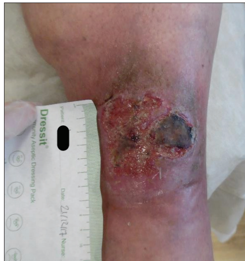
Figure 8 (left) and Figure 9 (right) show improvement in the wound bed following 12 weeks of using easywrap.