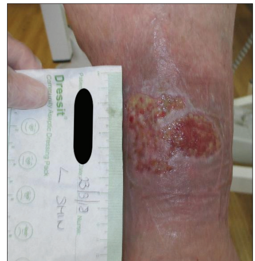
Figure 10 (left). Case study 3: The wound at initial presentation.