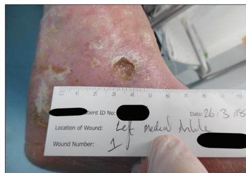
Figure 11 (right). Case study 3: The wound following 3 weeks of treatment with easywrap.