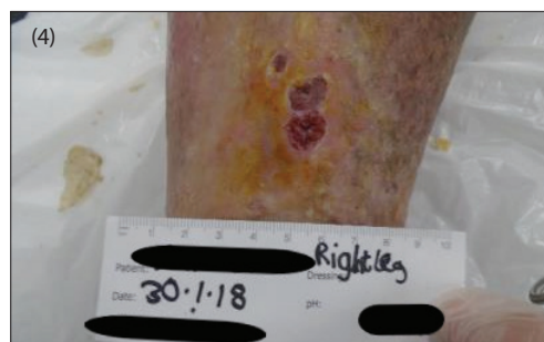
Figures 4–7 showing improvement in wound and surrounding skin while using easywrap over a 6 week period.